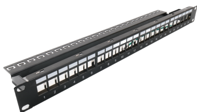
KJP1UBEF 24 port unloaded patch panel 1U