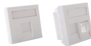
KJFP4545xPEF 45x45 faceplate 1 or 2 ports flat